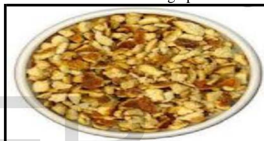
Addition of Concentrated sulphuric acid to bitter orange peel